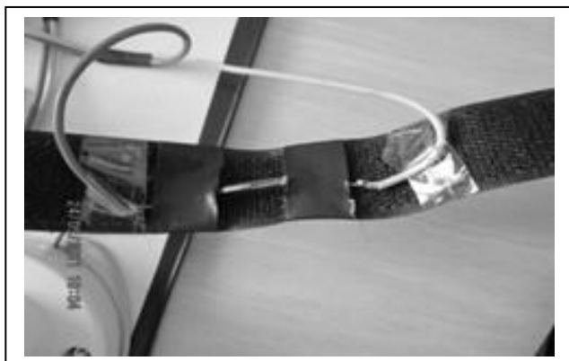
Fig. 2 seat belt BAN sensor

In order to ubiquitously monitor the parameters of the passenger we fix all the sensors in the seat belt