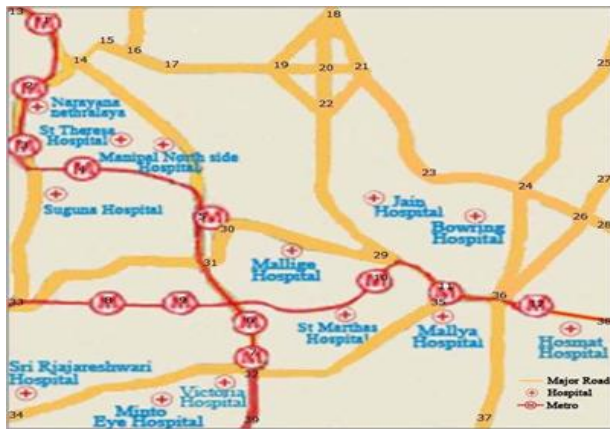
Fig. 3 ambulance monitor map